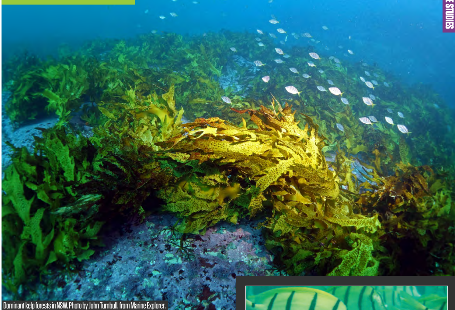
Dominant kelp forests in NSW.