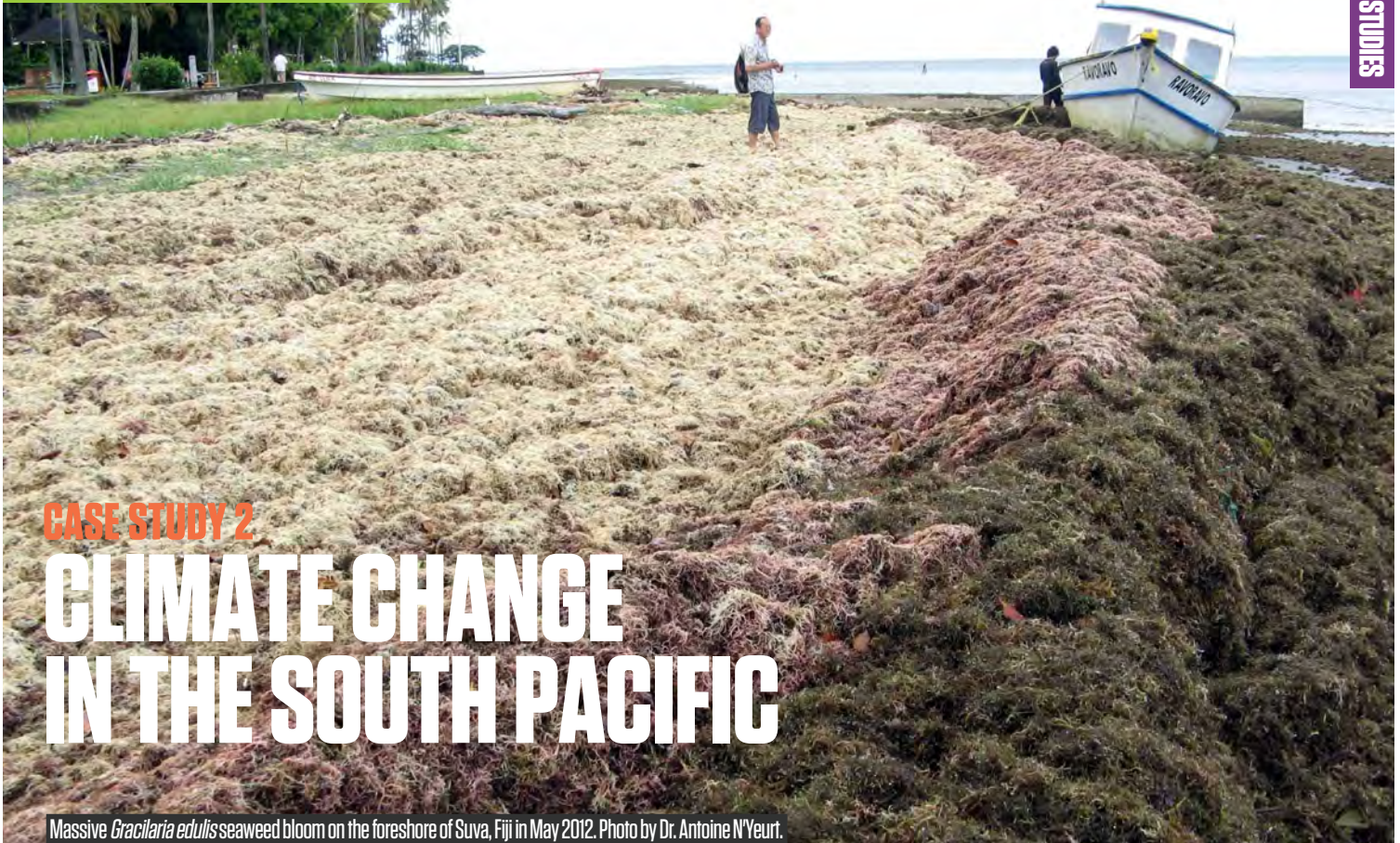
Massive Gracilaria edulis seaweed bloom on the foreshore of Suva, Fiji in May 2012.