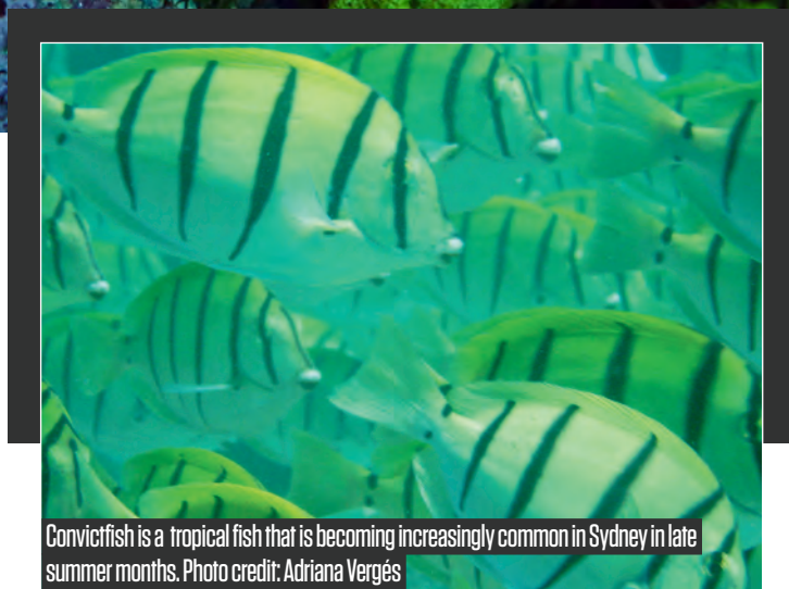
Convictfish is a tropical fish that is becoming increasingly common in Sydney in late summer months.

Researchers fear some of the damage to kelp forests near the warm edge of their distribution is permanent, and the kelp will never grow back, which Adriana notes has a huge impact on ecosystems. “When you remove seaweed forests all the species that depend on that habitat also disappear and you get a completely different community moving into the area.”